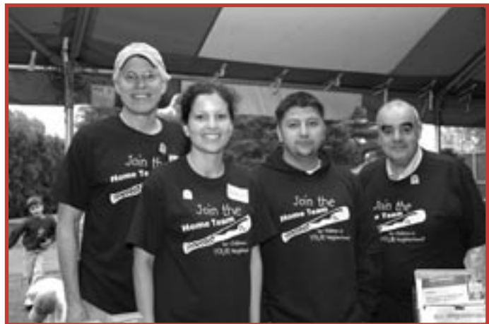
Staff from Neighborhood Health Plan of Rhode Island staff the event.