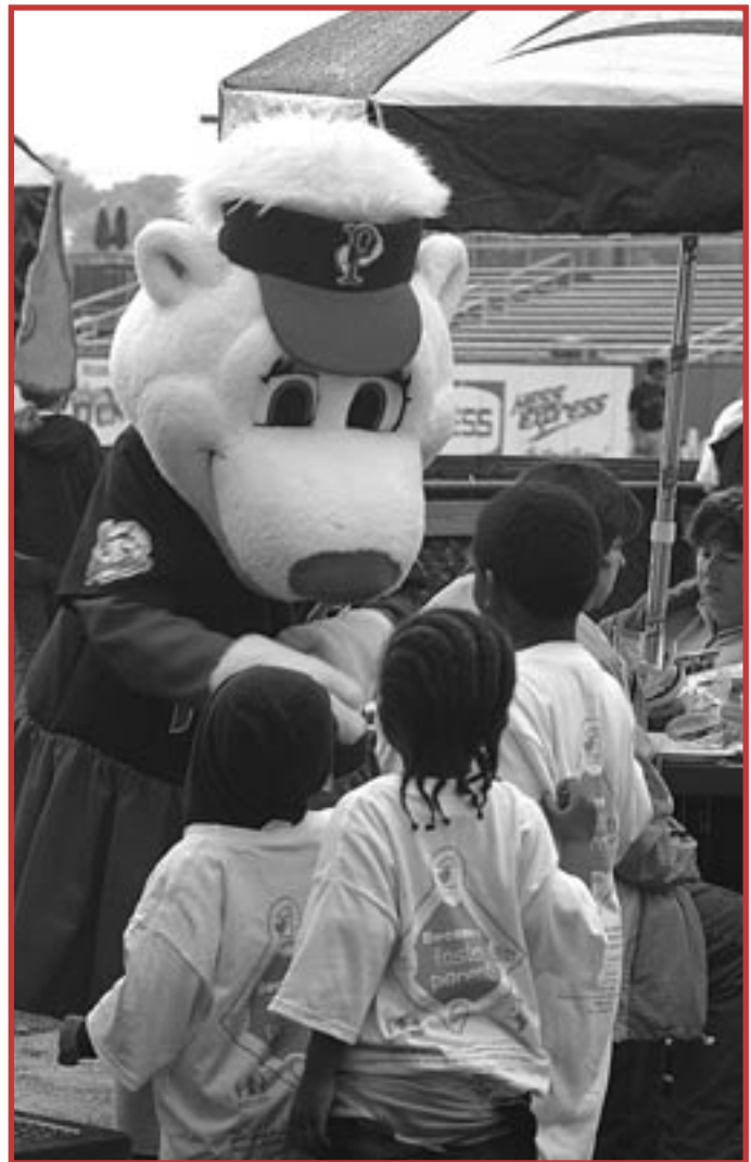
Mascot “Sox” entertains the children before the game.

Thank you all for helping to make this event such a tremendous success. Because of your support, over 425 children and families turned out for a wonderful night of Paw Sox baseball vs. the Louisville Bats. The evening featured t-shirts for all (we still have some extra shirts available on request!) a pre-game tent party barbeque, visits from the team’s mascots Paws and Sox, and an autograph session with a Paw Sox player! Our tent and reserved seating were right along the first base line and several lucky children even caught some foul balls! This was such a wonderful way for us to conclude National Foster Care Month in Rhode Island. Many foster families who attended the event took the time to express how much fun (despite the weather and final score!) they had and that they enjoyed the food, the location, and the opportunity to meet with other foster families.