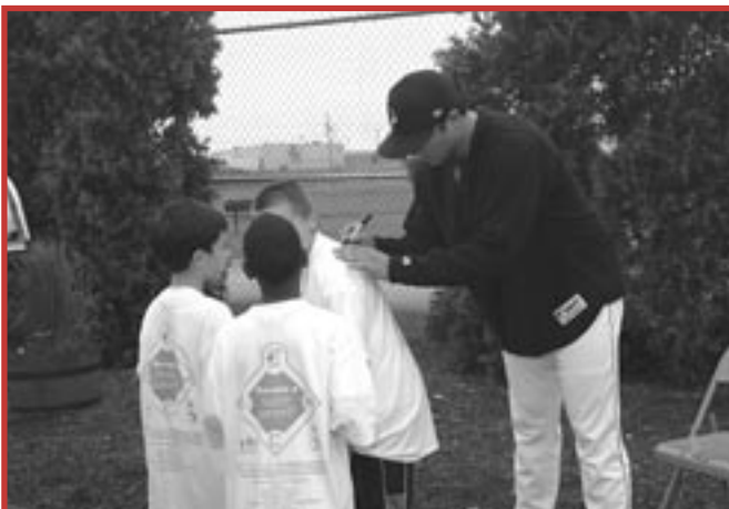
A Paw Sox Player signs autographs before the game.